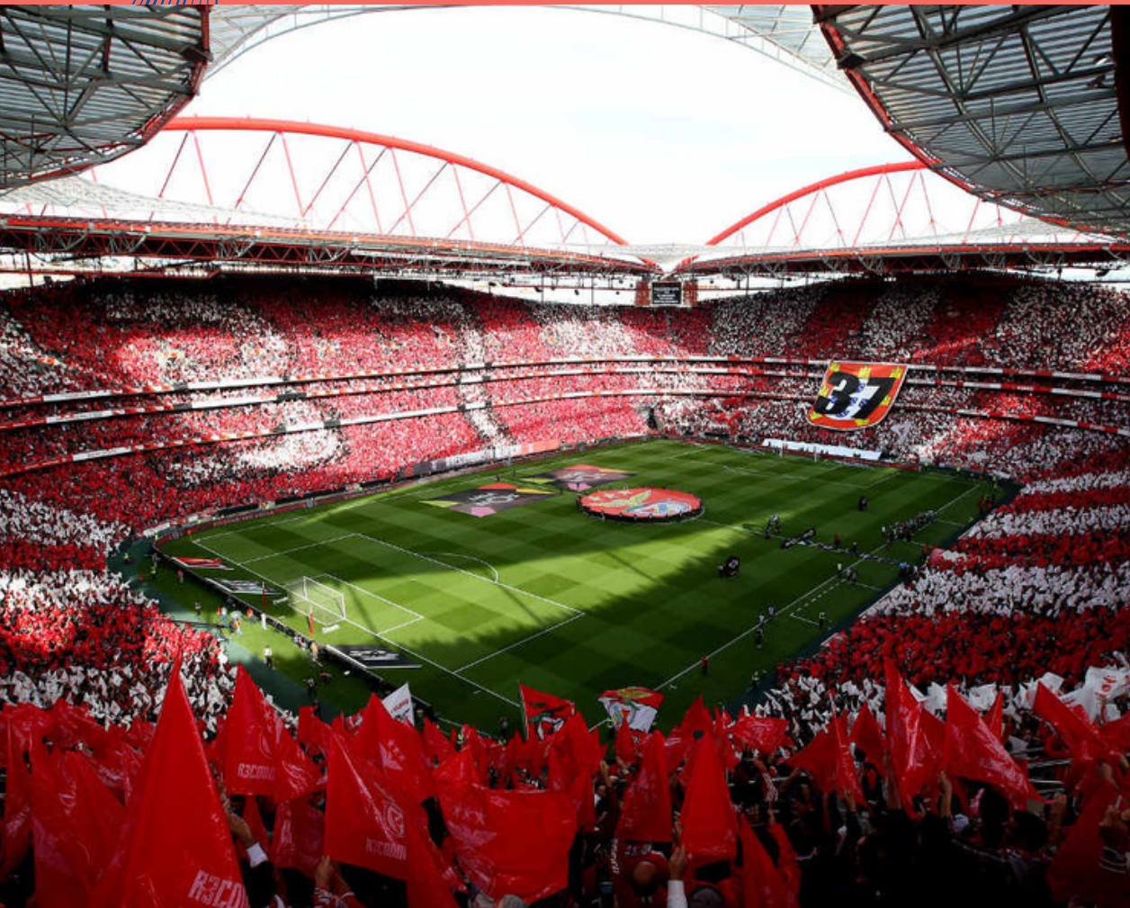
STADIUM OF LIGHT